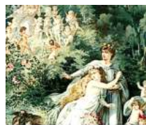
A MIDSUMMER NIGHT'S DREAM WILLIAM SHAKESPEARE